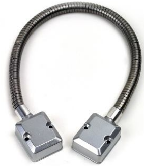
DL - S01

DL-S01 offers an economic method of transferring power from the door frame onto the door leaf. 400mm (15.75') stainless steel armored flex conduit with small plastic end caps.